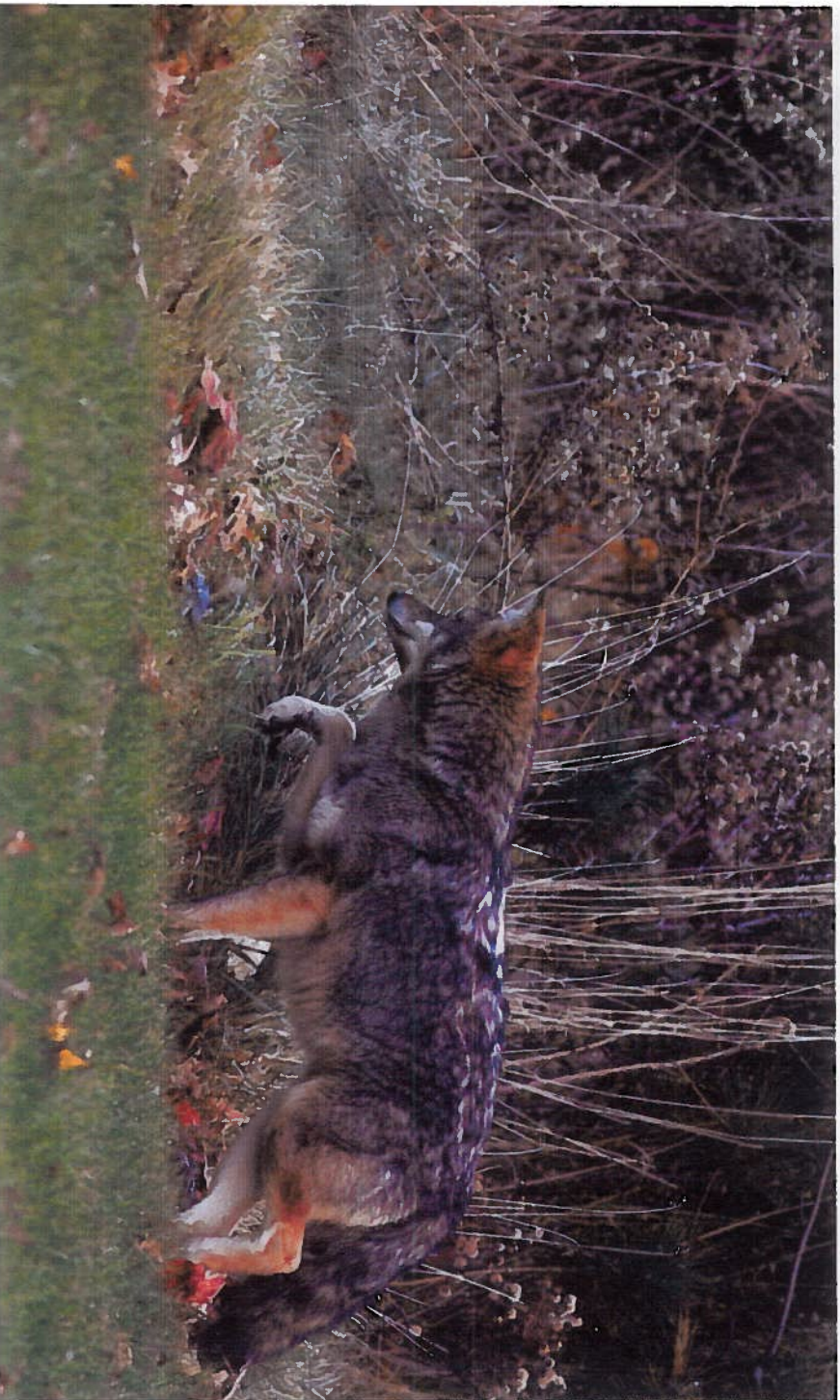
▲ Coyotes are predators of such medium-sized animals as rabbits, mice, voles, squirrels and chipmunks, keeping down the rodent population.