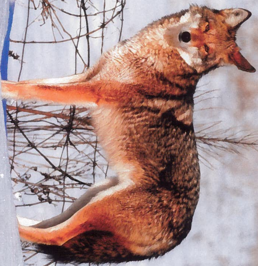
The health of coyotes indicates the health of an ecosystem. Coyotes keep land in balance.