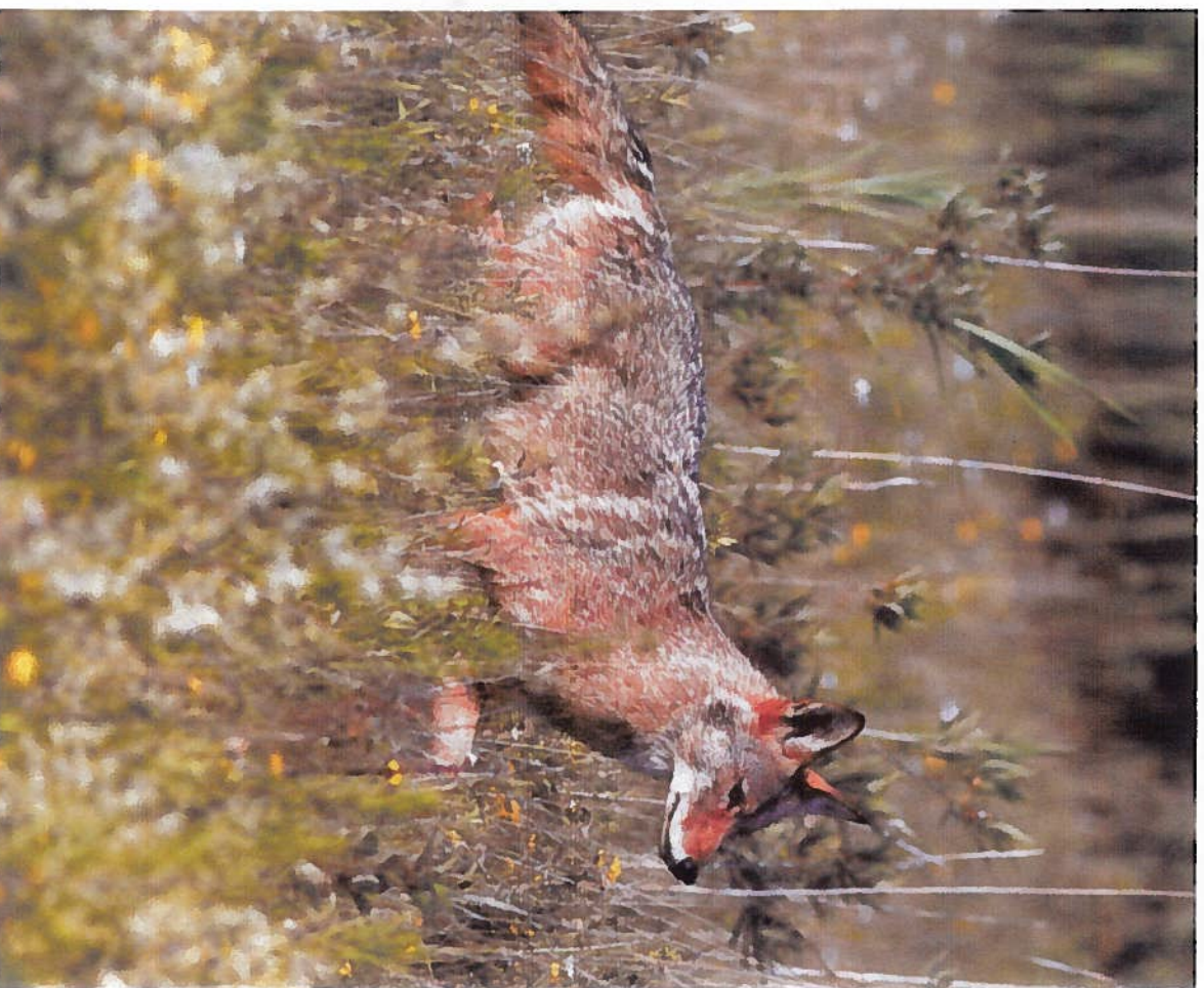
▲ The mother of the young coyotes opposite, keeping watch at a distance.

I'm sure many in town shared that sentiment, but there was no fighting the horror stories about marauding coyotes that had ripped their dogs from someone's arms. There seem to be two attitudes to coyotes: of hunters who can kill coyotes year round without a special licence, and wildlife supporters who believe coyotes aren't the ravenous predators of myth and cartoon.