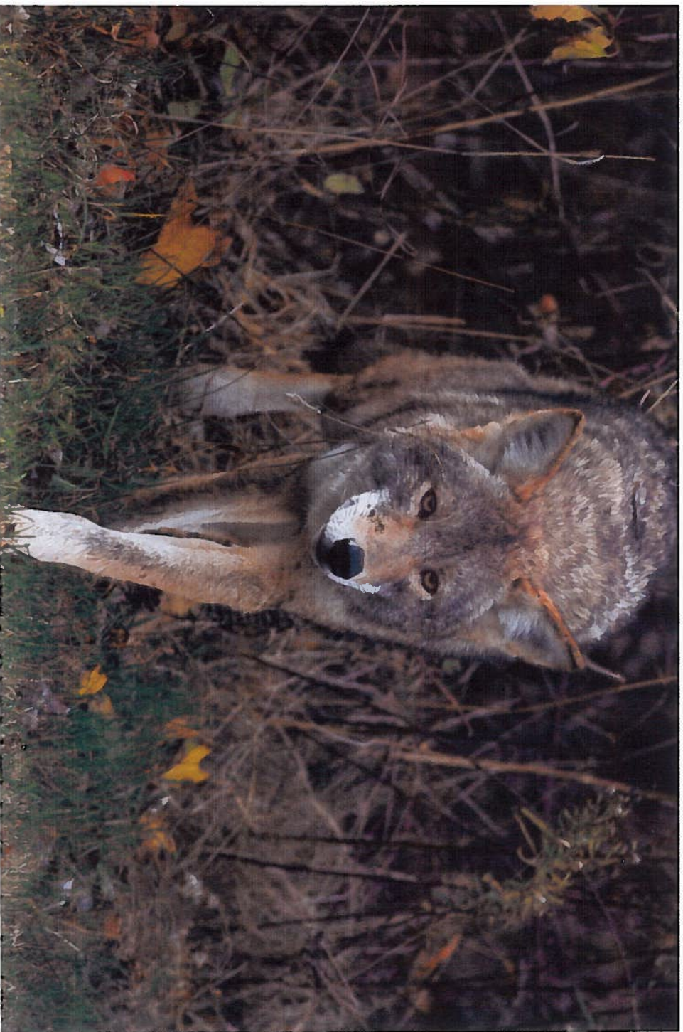
▲ Coyotes are stealthy predators that have been appreciated and respected by First Nations.