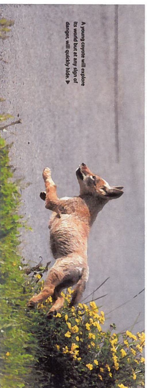
▲ A young coyote will explore its world but at any sign of danger, will quickly hide. ▶