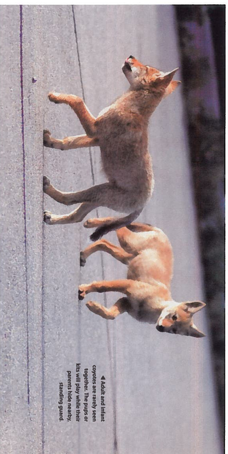
▲ Adult and infant coyotes are rarely seen together. The pups or kits will play while their parents hide nearby, standing guard.